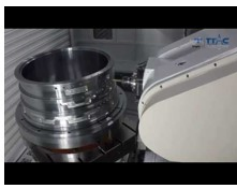
Table on Table